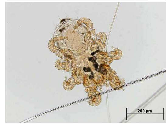
Fig 3. Trichosurolaelaps striatus - Whole mount 200x

Entrapement - multiple contusions and puncture wounds Mite infestation - Trichosurolaelaps striatus