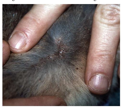
Fig 1. Skin mites and hyperkeratosis

Internal findings : The lungs are moderately congested. The gastrointestinal tract contains scant ingesta.